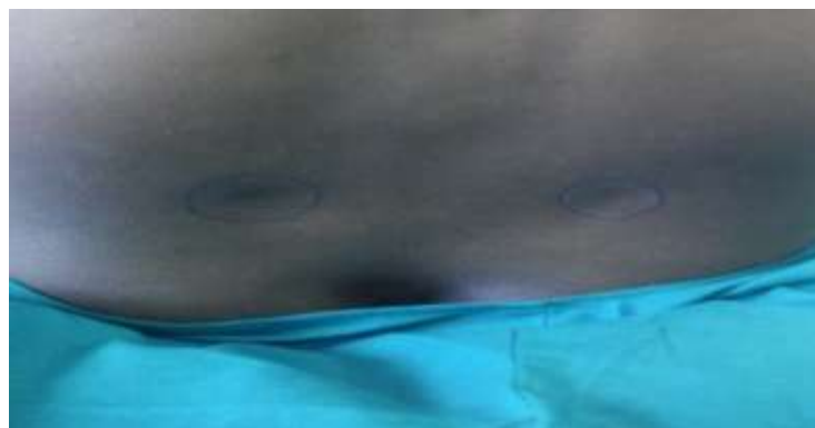
Figure2. Showing skin dimples