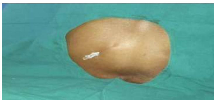
Figure3. Showing Taylor's approach for the subarachnoid block

After arrival in the operation theatre standard monitoring including heart rate, continuous electro cardiogram, pulseoxymetry, and non invasive measurement of blood pressure, cycled at 3 minutes intervals were done. All the patients were preloaded with Ringer lactate 10 ml per kg as there is a chance of high levels of